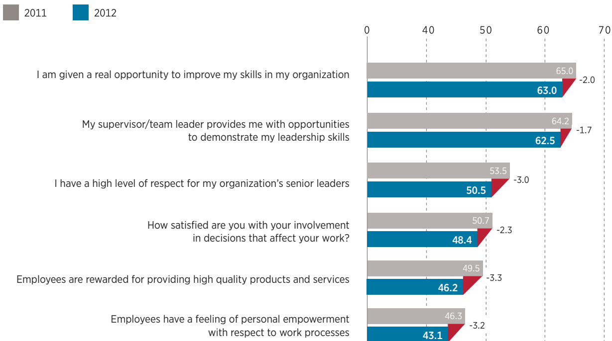
FIGURE 2 Percentage of positive responses and trends on questions that drive innovation